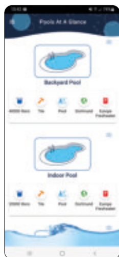
Manages 5 pools at the same time